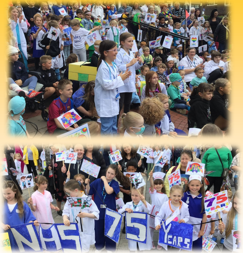
Pupils had an amazing time at the Biddulph Parade on Saturday, it was a great day with an carnival atmosphere! Here are just a few photos!