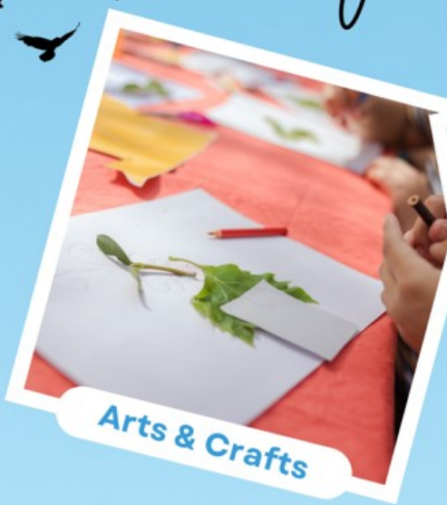
Arts & Crafts