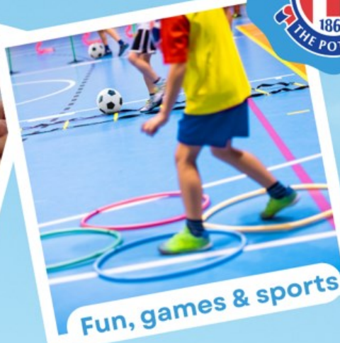
Fun, games & sports